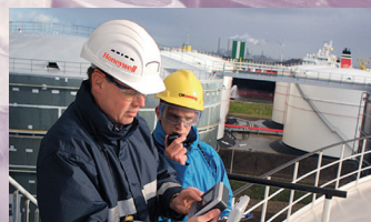
RAIL & FIELD ASSETS